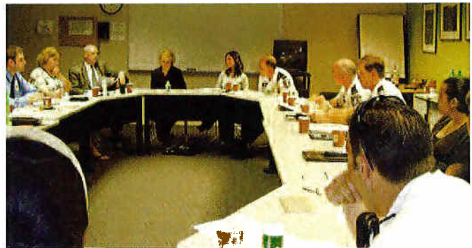
Monthly Case Consultation meeting at Family Service of Rhode Island