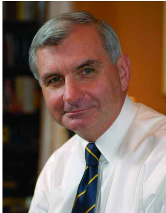
U.S. Senator Jack Reed receives 2008 Brighter Futures Award

Agency receives Better Business Bureau Accreditation – one of only four non-profits in the Ocean State earning accreditation.